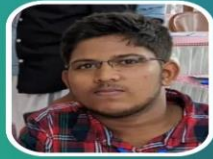
Rinshad D2 ECO