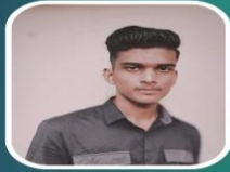
Ajuwad farseen D3 ECO